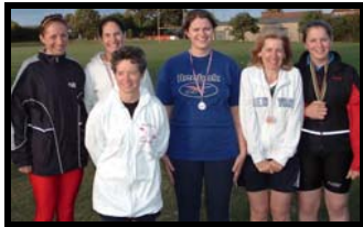
Ladies 800 metres medals 2004