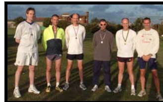
Mens 800 metres medals 2004

Registration between 7.00 – 7.15pm. 1 pound to enter and everybody ready for the earliest possible start, especially for the 5000m and 3000m please. The best 6 scores count from 7 events.