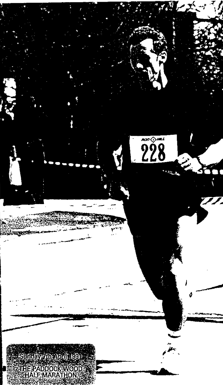
Sunday 7th April 1991 THE PADDOCK WOOD HALF MARATHON