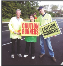
34th RUNNING OF THE HELLINGLY 10K

Venue: Hellingly Village Hall, North Street, Hellingly, Nr. Hailsham, East Sussex, BN27 4DS